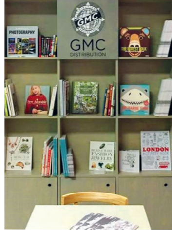
Guadalajara Book Fair