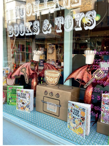
Moon Lane Books