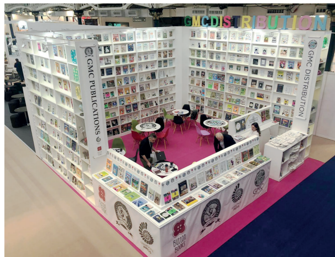
London Book Fair

The sales force, comprising our in-house team, freelance and salaried reps, services all book trade and non-trade customers in the UK and Europe, with options for all other territories. Whilst GMC is very well established in traditional markets, we excel at reaching specialist, gift, mail order and other non-traditional outlets.