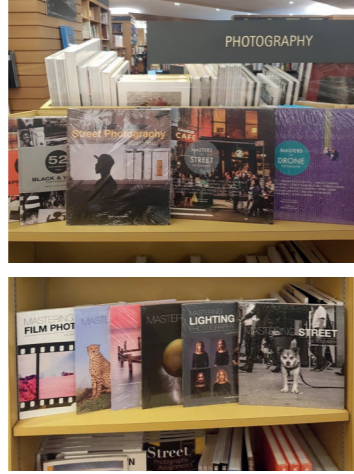
Kinokuniya Takashmaya, Singapore