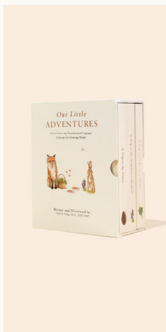
OUR LITTLE ADVENTURES