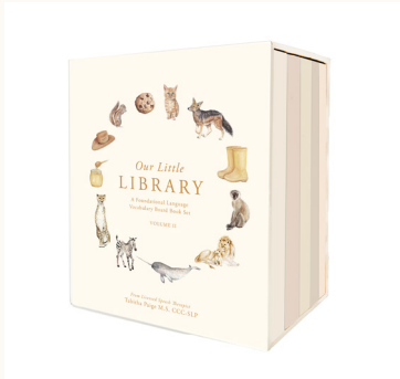
Our Little Library Vol. 2 November 2024 | 152 x 127mm ISBN: 9781958803882 Price: £27.99