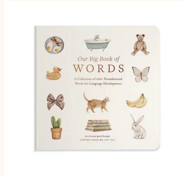
Our Big Book of Words November 2024 | 235 x 235mm ISBN: 9781958803875 Price: £14.99