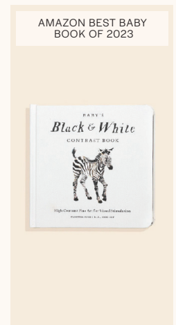
BABY'S BLACK AND WHITE CONTRAST BOOK