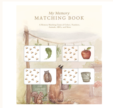
My Memory Matching Book November 2024 | 279 x 241mm ISBN: 9781958803905 Price: £15.99