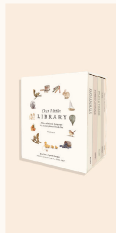
OUR LITTLE LIBRARY VOL. 1