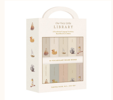
Our Very Little Library Board Book November 2024 | 216 x 165mm ISBN: 9781958803868 Price: £27.99