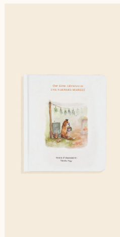
OUR LITTLE ADVENTURE TO THE FARMERS MARKET