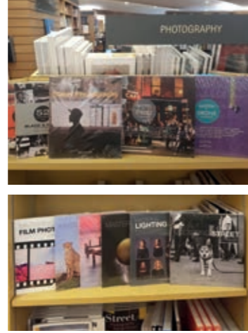
Kinokuniya Takashmaya, Singapore