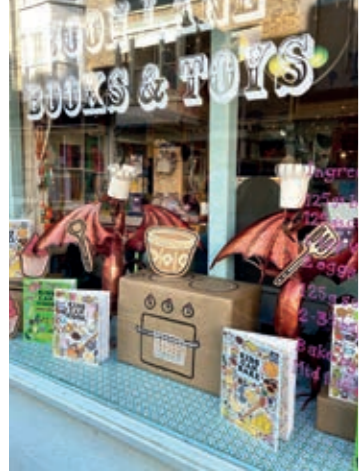
Moon Lane Books