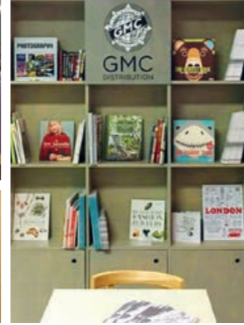
Guadalajara Book Fair