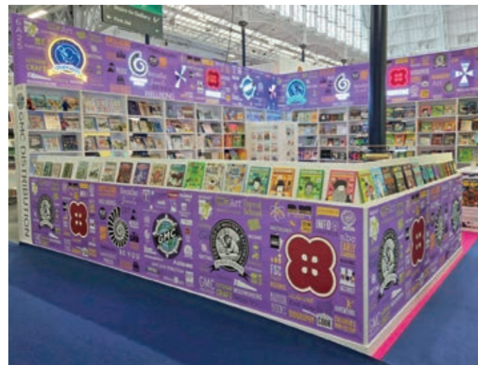
London Book Fair

The sales force, comprising our in-house team, freelance and salaried reps, services all book trade and non-trade customers in the UK and Europe, with options for all other territories. Whilst GMC is very well established in traditional markets, we excel at reaching specialist, gift, mail order and other non-traditional outlets.